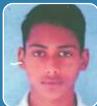
Prince Pal Best Gymnast Inter College Artistic Gymnastics